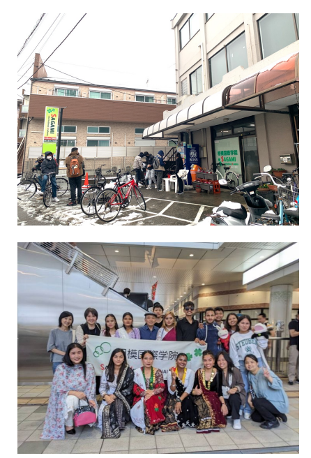
We have exchange events between students and have a lot of fun with eniovable time.

• Our teachers have lots of experiences, such as teaching abroad. Our teaching method has